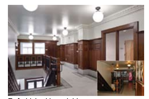
Refurbished boys lobby