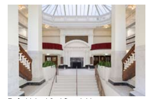
Refurbished 2nd floor lobby