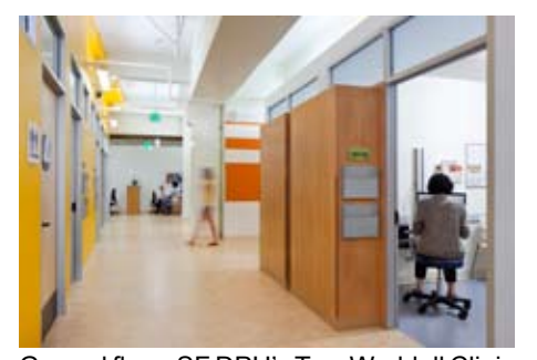
Ground floor: SF DPH's Tom Waddell Clinic