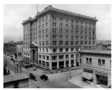
Central YMCA under construction, c.1910

In 2007, the Tenderloin Neighborhood Development Corporation (TNDC) acquired the building (now known as Kelly Cullen Community). Through a truly complex 5-year long process, TNDC's $95M rehabilitation provided extensive rehabilitation of the exterior, including repairs to the original windows as well as reconstruction of the main entry and ground floor storefronts that