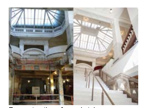
Reconstruction of grand stairs