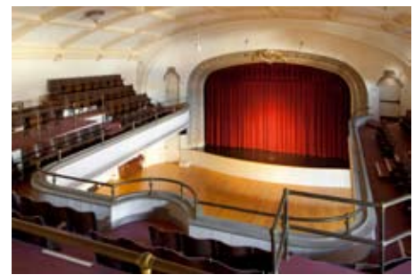
2nd floor auditorium with new shear wall