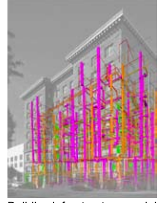
Building infrastructure model