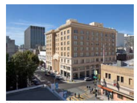
Modernized, converted mixed-use building